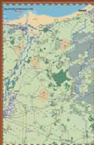
Intermediate Scenario 3 "Saga of the 6th Airborne"