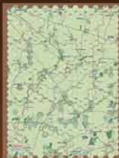
Introductory Scenario 6 "On to Bayeux"