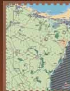
Intermediate Scenario 2 "The Race for Caen"