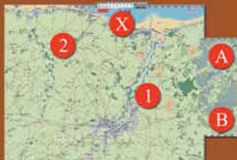
Advanced Scenario 2 "The Initial Plan"