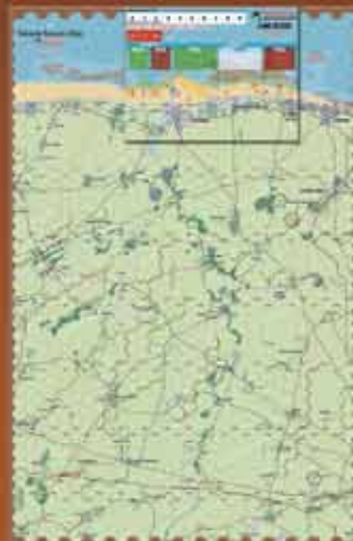
Intermediate Scenario 4 "O Canada"