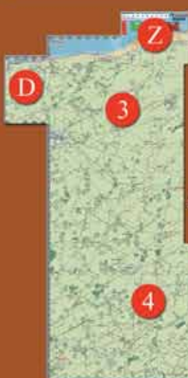
Advanced Scenario 1 "The Right Hook"