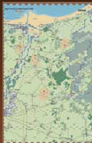
Intermediate Scenario 1 "Day of Days"