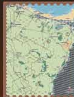
Introductory Scenario 4 "To the Sea"