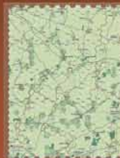
Intermediate Scenario 5 "The Bloody Battle of Tilly"