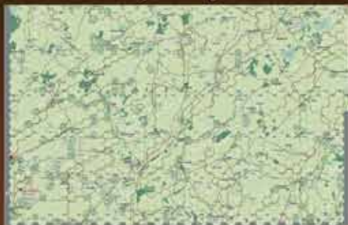
Introductory Scenario 5 "Day of the Tiger"